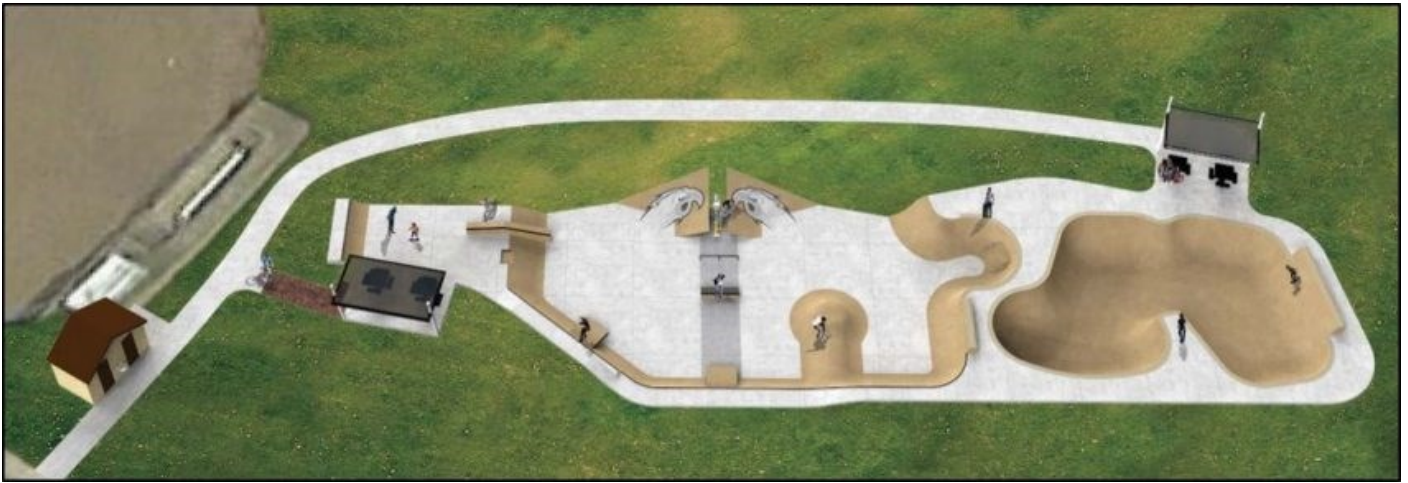
Initial concept provided by Grindline Skateparks

The Washington State Recreation and Conservation Board announced the award of a grant to the City of Ferndale for Metalworks Skate Park, a 10,000 square foot skate park facility planned at Pioneer Park.