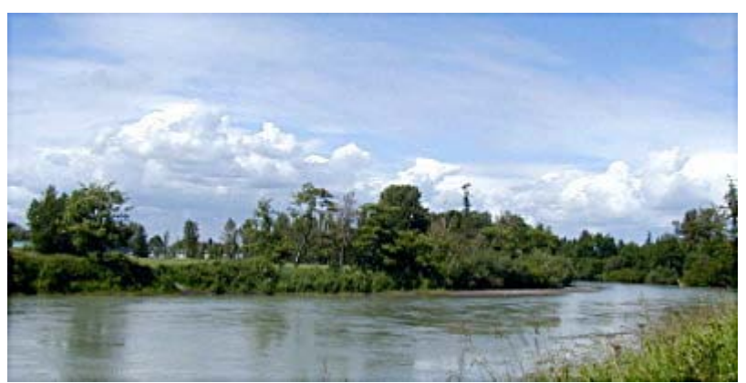
Nooksack River as it flows through Ferndale

The CMT currently runs north from Bellingham through Hovander Park and then out to the Cherry Point area. As part of the Whatcom County Pedestrian and Bicycle Nooksack River Bridge project (discussed above), the CMT's route could be altered to include passage through Ferndale along the Nooksack River and then out to the coast.