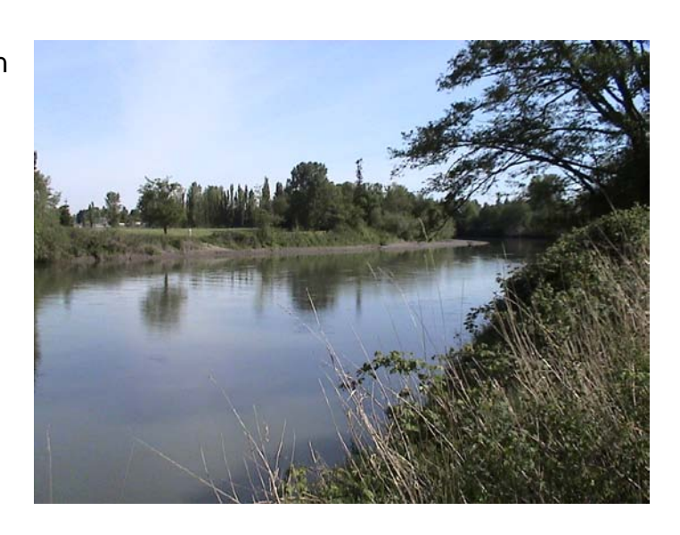
View of Vanderyacht Park from Hastings Park

This incentive approach would permit increased development within "conservancy" zone along the river when combined with public access. For projects that includes Public Access and whose affect yields a net increase in ecological function, the height, setback, and lot coverage limitations would be set at the next highest use category (see matrix on page 89 of SMP). For example, a project in the Conservancy Zone that qualifies for incentives would be bound by the height, setback, and lot coverage limitation of the Rural classification.