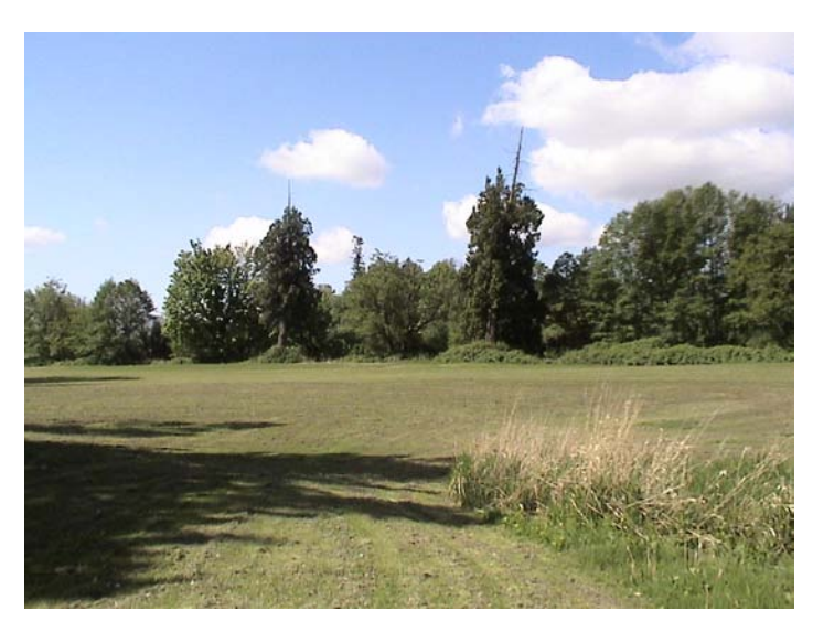
Riverfront Golf Course – Looking Toward Nooksack

Due to the designation of "Conservancy" for these private parcels fronting the Nooksack, most development activity would be precluded. Under the City's incentive-based approach for riverfront restoration, development that normally would not be