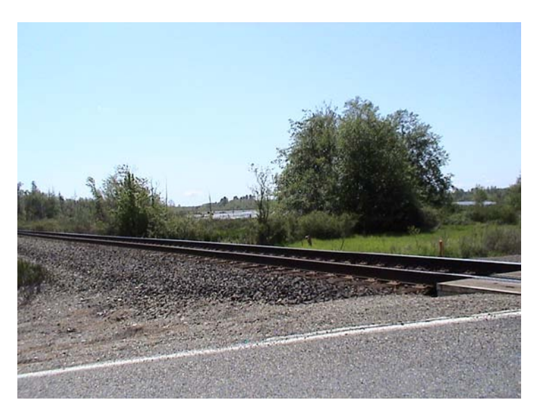
Goal 3 Improve water quality

Ensure that the requirements for buffers or other mitigation measures are appropriate and facilitate the achievement of impaired function restoration