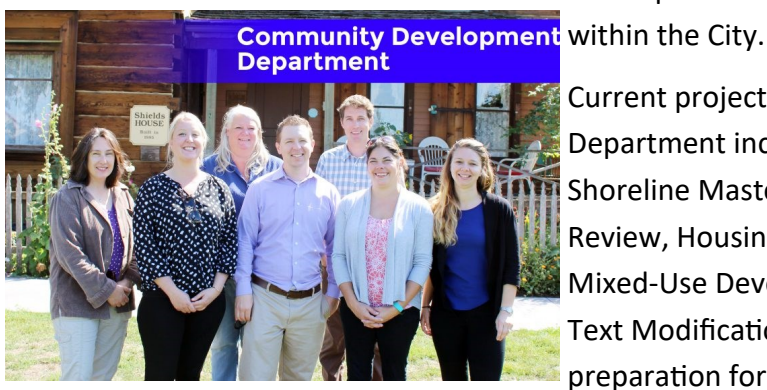
to the Comprehensive Plan.

Current projects in the Department include: Shoreline Master Program Review, Housing Infill, Mixed-Use Development Text Modifications, and preparation for Updates