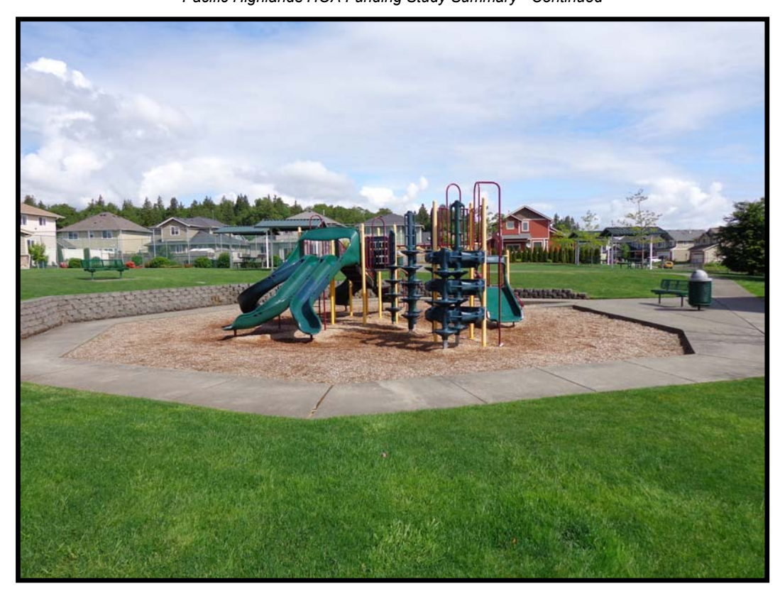
Excellent Association Play Ground