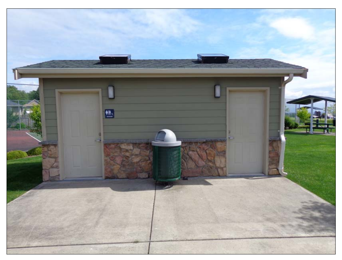
Park Rest Room and Small Office