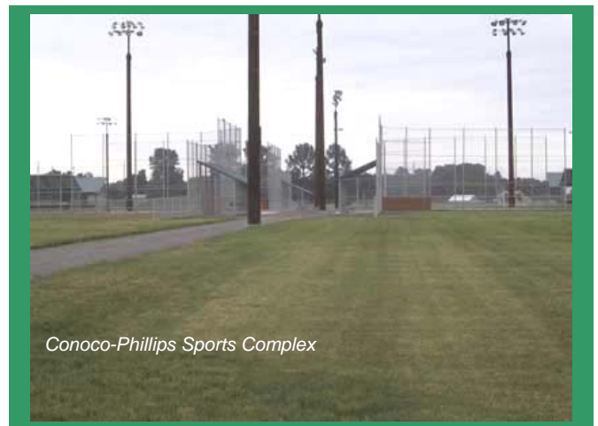
Conoco-Phillips Sports Complex

One new soccer field to the south of the baseball complex should be complete and ready for use by next summer. Also, we have scheduled the completion of an irrigation/sprinkler system for a new multi-purpose field to the west of the baseball complex. Hopefully by the spring of 2009 this field will be used for baseball, softball, rugby, and other activities that require simple, open grass space.