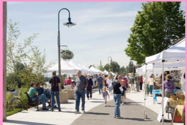
“Farmers Market Saturdays have proven to be very popular with residents and tourists. 2009 promises to be even better.” - Mayor Gary Jensen

the availability of restrooms and hot water we hope that increase food vending will occur at the Farmers Market. The Chamber of Commerce is working towards providing free wi-fi access to the Park via this building. Recycling a vacant building is the ultimate “green” practice! It will be entertaining to watch the old visitors center “picked up and moved” to the Riverwalk.