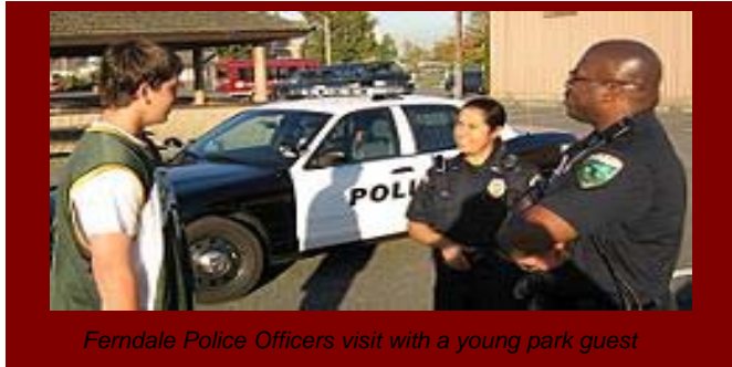
Ferndale Police Officers visit with a young park guest

Having a City Government Complex that shares parking lots and shared facilities is certainly a better bang for your buck! A combination Council Chambers and Municipal Court will be just one of the new features of the complex. Anyone who has sat through a Council meeting on our less than comfortable