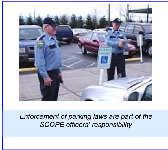
Enforcement of parking laws are part of the SCOPE officers' responsibility

S.C.O.P.E. stands for “ Senior Citizens on Patrol Enhancement. ” The unit was formed in 1999 and has been active ever since. S.C.O.P.E. Officers perform a variety of necessary but lower priority duties, helping to free-up fully commissioned officers to deal with law enforcement issues of a more serious nature.