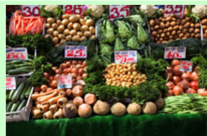
The new park is designed to be an area for festivals, farmers markets and other special events.

This project will feature not only a great place to sit and enjoy the river but also a spot to do some fishing or to just simply relax and commune with nature.