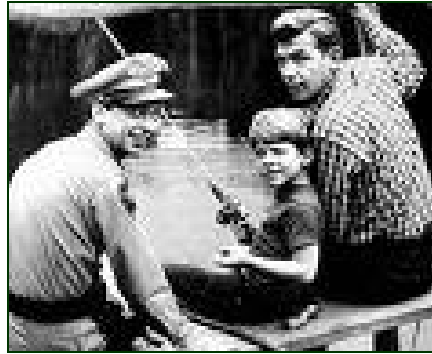
Thoughts of the City Administrator

Work has begun and will continue this summer on an important project here in Ferndale – the construction of the Centennial Riverwalk. Located on Front Street and running from the downtown-side of the Nooksack River Bridge southward nearly to the entrance of Pioneer Park, this project is intended to celebrate our relationship with the river and will provide a pedestrian link between Vanderyacht Park and Pioneer Park. If all goes as planned, the new park will be open by Thanksgiving and should prove to be a major amenity in the City.