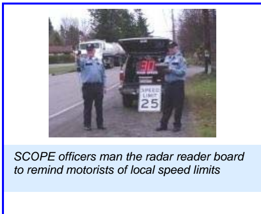
SCOPE officers man the radar reader board to remind motorists of local speed limits

S.C.O.P.E. volunteers have a limited law enforcement commission allowing them to write $250 tickets for vehicles illegally parked in handicapped parking spaces. The unit also perform a wide variety of other services to the community including home security checks for vacationing citizens, setting up and manning radar devices to monitor traffic speed in school zones, retrieve found bicycles, assisting with traffic control at major city events, and assisting patrol officers.